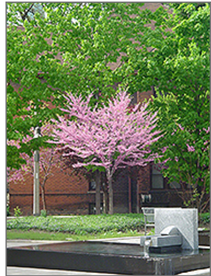
Eastern Redbud (tree form) in bloom

Eastern Redbud (tree form) is recommended for the following landscape applications;