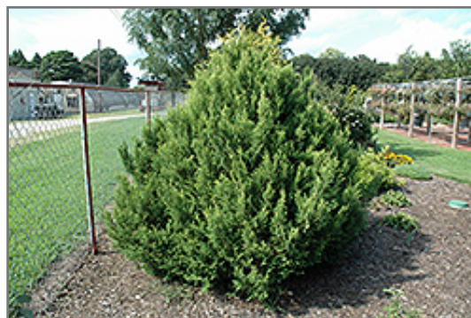
Cream Ball Falsecypress

Cream Ball Falsecypress is recommended for the following landscape applications;