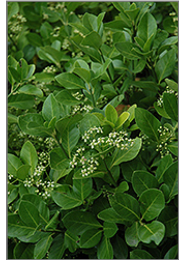
Manhattan Spreading Euonymus flowers

This shrub performs well in both full sun and full shade. It is very adaptable to both dry and moist locations, and should do just fine under average home landscape conditions. It is not particular as to soil type or pH. It is highly tolerant of urban pollution and will even thrive in inner city environments, and will benefit from being planted in a relatively sheltered location. This is a selected variety of a species not originally from North America.