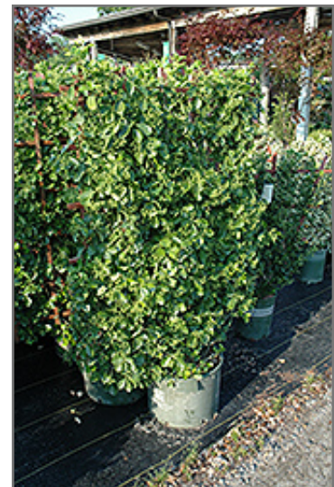
Manhattan Spreading Euonymus