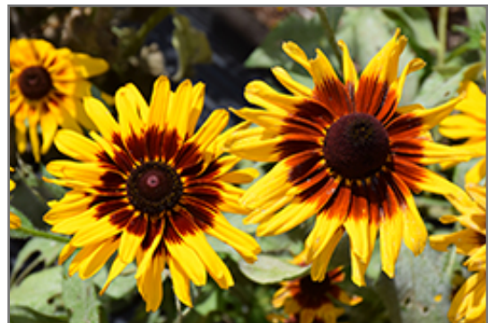
Denver Daisy Coneflower flowers