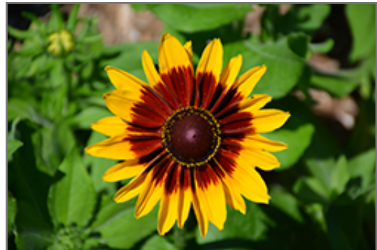
Denver Daisy Coneflower flowers

Denver Daisy Coneflower is an herbaceous perennial with an upright spreading habit of growth. Its medium texture blends into the garden, but can always be balanced by a couple of finer or coarser plants for an effective composition.