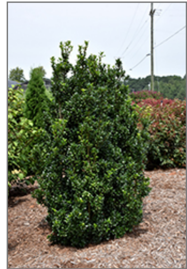
Castle Wall Meserve Holly

Castle Wall Meserve Holly is recommended for the following landscape applications;