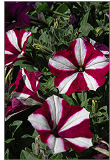
Easy Wave Burgundy Star Petunia flowers

Easy Wave Burgundy Star Petunia is recommended for the following landscape applications;