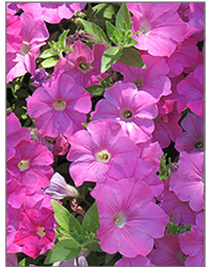
Easy Wave Pink Petunia flowers

Easy Wave Pink Petunia is a dense herbaceous annual with a trailing habit of growth, eventually spilling over the edges of hanging baskets and containers. Its medium texture blends into the garden, but can always be balanced by a couple of finer or coarser plants for an effective composition.