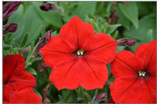
Easy Wave Red Petunia flowers

Easy Wave Red Petunia is a dense herbaceous annual with a trailing habit of growth, eventually spilling over the edges of hanging baskets and containers. Its medium texture blends into the garden, but can always be balanced by a couple of finer or coarser plants for an effective composition.