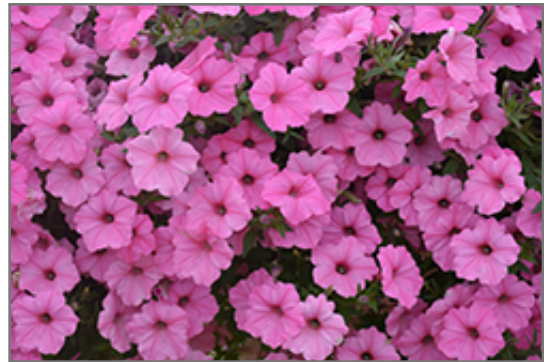
Supertunia Vista Bubblegum Petunia flowers

Supertunia Vista Bubblegum Petunia is recommended for the following landscape applications;