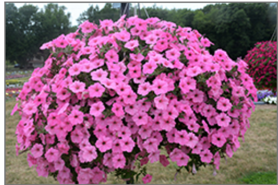
Supertunia Vista Bubblegum Petunia in bloom

Supertunia Vista Bubblegum Petunia will grow to be about 18 inches tall at maturity, with a spread of 24 inches. When grown in masses or used as a bedding plant, individual plants should be spaced approximately 20 inches apart. Its foliage tends to remain dense right to the ground, not requiring facer plants in front. This fast-growing annual will normally live for one full growing season, needing replacement the following year.