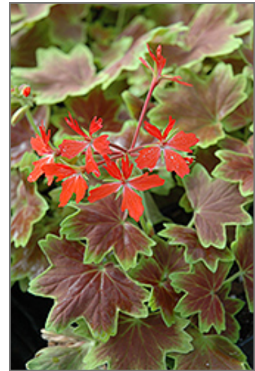
Vancouver Centennial Geranium flowers