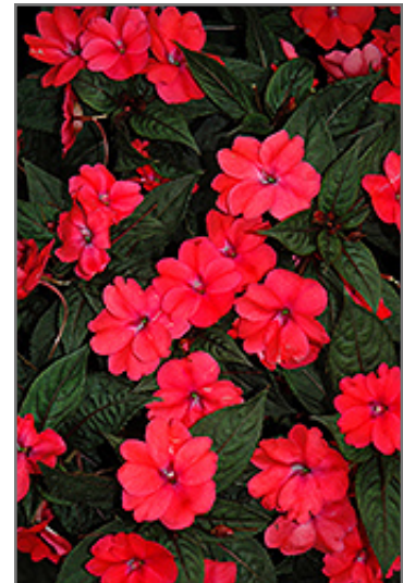
SunPatiens Compact Deep Rose New Guinea Impatiens flowers

This plant will require occasional maintenance and upkeep, and should not require much pruning, except when necessary, such as to remove dieback. It is a good choice for attracting bees and butterflies to your yard. It has no significant negative characteristics.