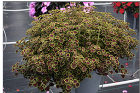
Burgundy Wedding Train Coleus