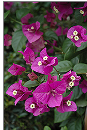
Purple Queen Bougainvillea flowers