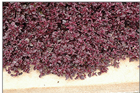
Purple Lady Blood Leaf