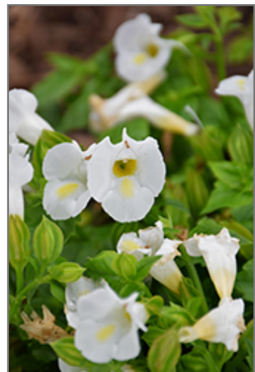
Catalina White Linen Torenia flowers