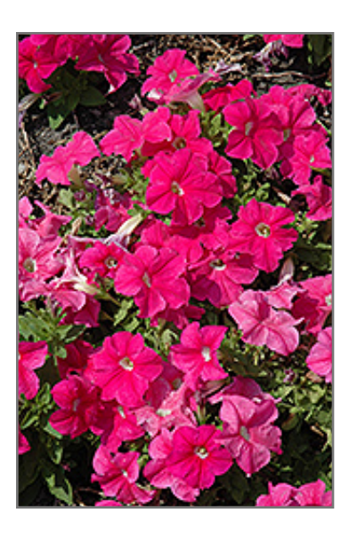
Pretty Grand Deep Pink Petunia flowers