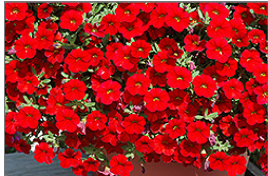
Cabaret Bright Red Calibrachoa flowers

This plant will require occasional maintenance and upkeep. Trim off the flower heads after they fade and die to encourage more blooms late into the season. It is a good choice for attracting bees and hummingbirds to your yard, but is not particularly attractive to deer who tend to leave it alone in favor of tastier treats. It has no significant negative characteristics.