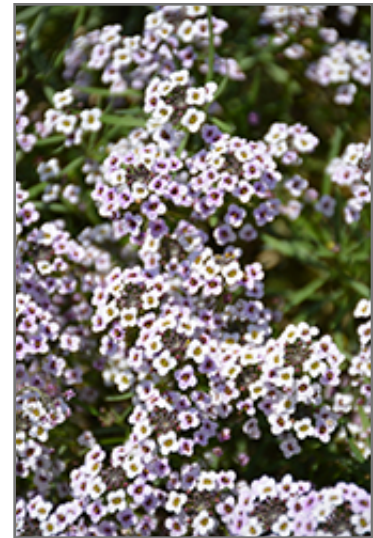
Blushing Princess Sweet Alyssum flowers

This plant will require occasional maintenance and upkeep, and should not require much pruning, except when necessary, such as to remove dieback. It is a good choice for attracting bees and butterflies to your yard, but is not particularly attractive to deer who tend to leave it alone in favor of tastier treats. It has no significant negative characteristics.