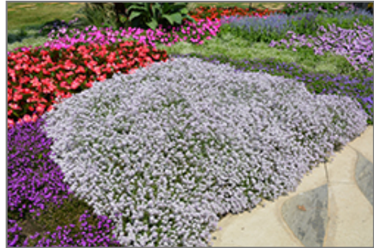
Blushing Princess Sweet Alyssum in bloom

Blushing Princess Sweet Alyssum is a fine choice for the garden, but it is also a good selection for planting in hanging baskets. Because of its trailing habit of growth, it is ideally suited for use as a 'spiller' in the 'spiller-thriller-filler' container combination; plant it near the edges where it can spill gracefully over the pot. Note that when growing plants in outdoor containers and baskets, they may require more frequent waterings than they would in the yard or garden.