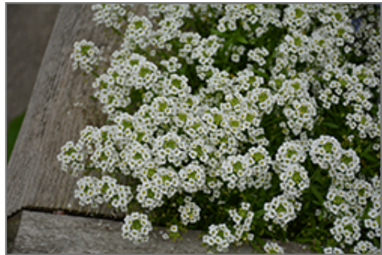
Snow Princess Alyssum flowers

Snow Princess Alyssum is recommended for the following landscape applications;