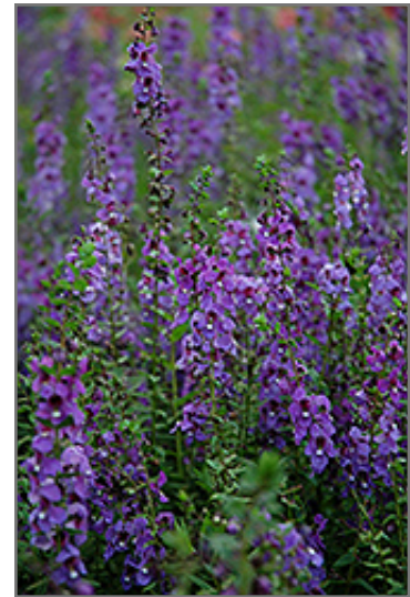
Serena Blue Angelonia flowers

Serena Blue Angelonia is recommended for the following landscape applications;