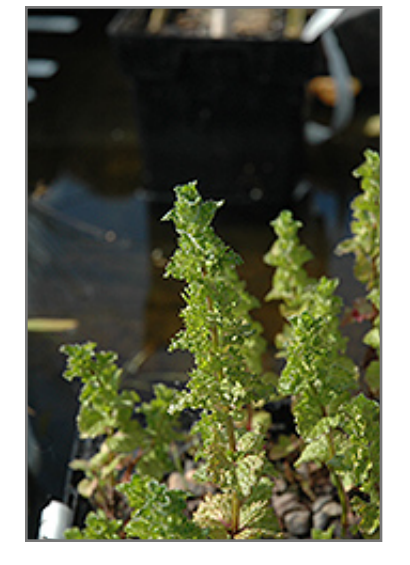
Curly Mint foliage