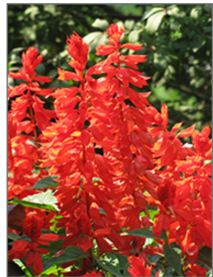
Lighthouse Red Sage flowers