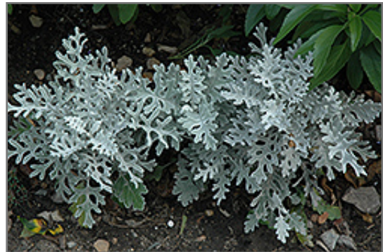
Silver Dust Dusty Miller foliage