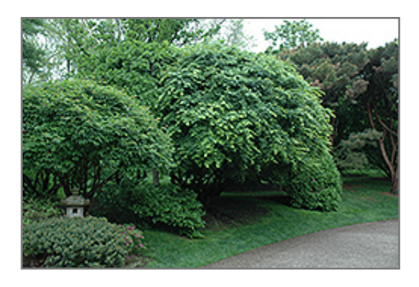
Japanese Maple

This is a relatively low maintenance tree, and should only be pruned in summer after the leaves have fully developed, as it may 'bleed' sap if pruned in late winter or early spring. It has no significant negative characteristics.