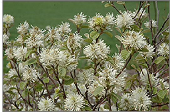
Dwarf Fothergilla flowers

This shrub does best in full sun to partial shade. It requires an evenly moist well-drained soil for optimal growth, but will die in standing water. It is not particular as to soil type, but has a definite preference for acidic soils, and is subject to chlorosis (yellowing) of the foliage in alkaline soils. It is somewhat tolerant of urban pollution. This species is native to parts of North America.