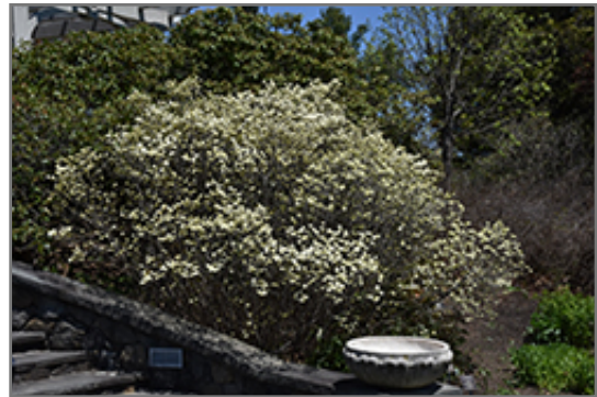
Dwarf Fothergilla in bloom

Dwarf Fothergilla is recommended for the following landscape applications;