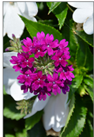
Superbena Royale Plum Wine Verbena flowers