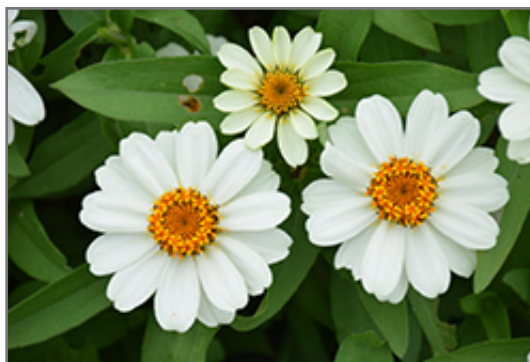
Profusion White Zinnia flowers