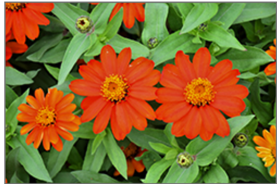
Zahara Fire Zinnia flowers

Zahara Fire Zinnia is recommended for the following landscape applications;