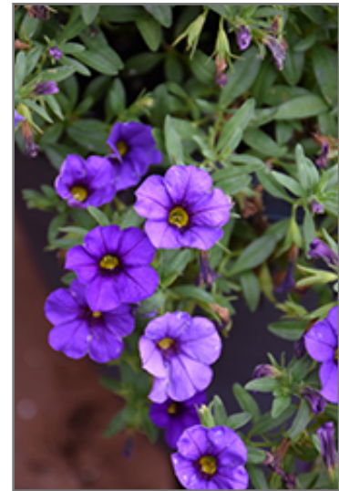
Aloha Kona Midnight Blue Calibrachoa flowers

This plant will require occasional maintenance and upkeep. Trim off the flower heads after they fade and die to encourage more blooms late into the season. It is a good choice for attracting bees and hummingbirds to your yard, but is not particularly attractive to deer who tend to leave it alone in favor of tastier treats. It has no significant negative characteristics.