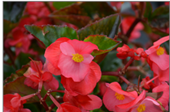
Big Rose Green Leaf Begonia flowers