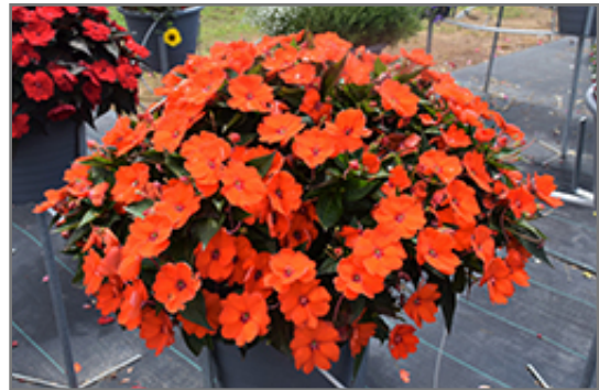
SunPatiens Compact Electric Orange New Guinea Impatiens in bloom

SunPatiens Compact Electric Orange New Guinea Impatiens is a fine choice for the garden, but it is also a good selection for planting in outdoor containers and hanging baskets. It can be used either as 'filler' or as a 'thriller' in the 'spiller-thriller-filler' container combination, depending on the height and form of the other plants used in the container planting. It is even sizeable enough that it can be grown alone in a suitable container. Note that when growing plants in outdoor containers and baskets, they may require more frequent waterings than they would in the yard or garden.