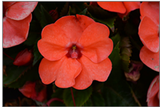
SunPatiens Compact Hot Coral New Guinea Impatiens flowers

This plant will require occasional maintenance and upkeep, and should not require much pruning, except when necessary, such as to remove dieback. It is a good choice for attracting bees and butterflies to your yard. It has no significant negative characteristics.