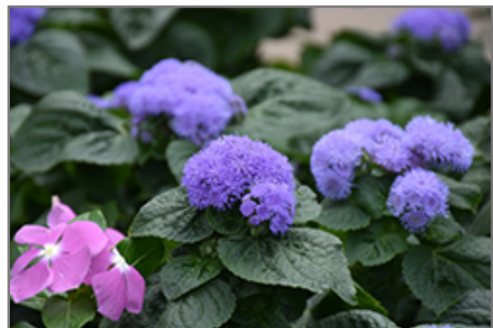
High Tide Blue Flossflower flowers