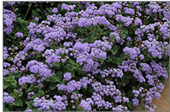
High Tide Blue Flossflower in bloom