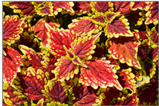
Oxford Street Coleus foliage