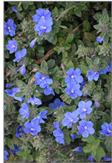
Blue My Mind Morning Glory flowers

Blue My Mind Morning Glory is recommended for the following landscape applications;