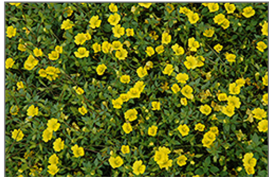
Magic Carpet Yellow Mecardonia flowers

Magic Carpet Yellow Mecardonia is recommended for the following landscape applications;