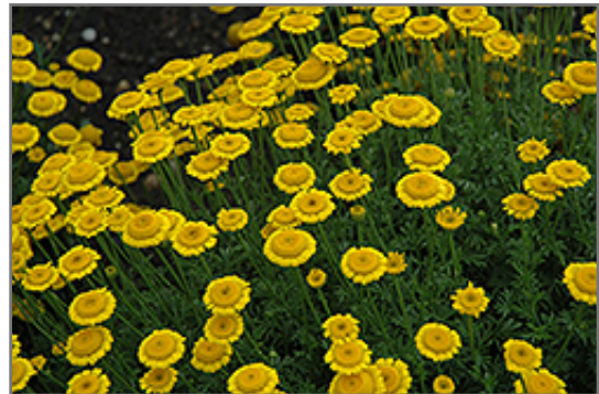
Charme Marguerite Daisy flowers

Charme Marguerite Daisy is recommended for the following landscape applications;