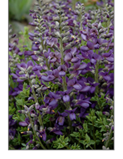
Decadence Blueberry Sundae False Indigo flowers