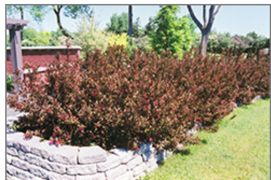
Wine and Roses Weigela