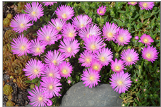
Table Mountain Ice Plant flowers

Table Mountain Ice Plant is recommended for the following landscape applications;