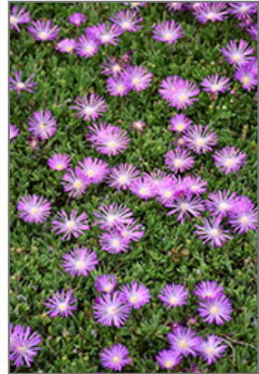
Table Mountain Ice Plant flowers

Table Mountain Ice Plant is a fine choice for the garden, but it is also a good selection for planting in outdoor pots and containers. Because of its spreading habit of growth, it is ideally suited for use as a 'spiller' in the 'spiller-thriller-filler' container combination; plant it near the edges where it can spill gracefully over the pot. Note that when growing plants in outdoor containers and baskets, they may require more frequent waterings than they would in the yard or garden.