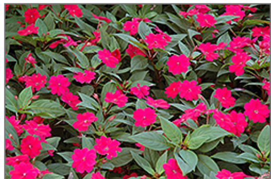
Bounce Cherry Impatiens in bloom