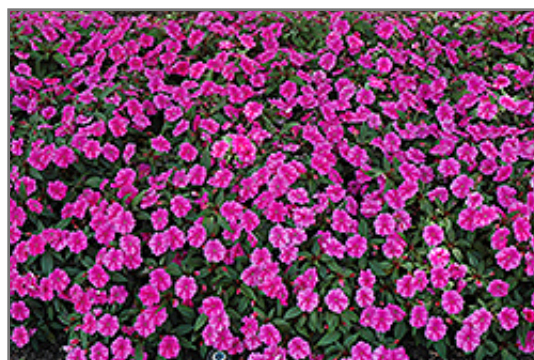
Bounce Pink Flame Impatiens in bloom