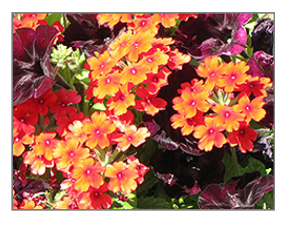
Obsession Scarlet Verbena flowers