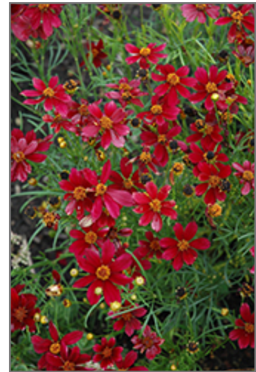
Red Satin Tickseed flowers