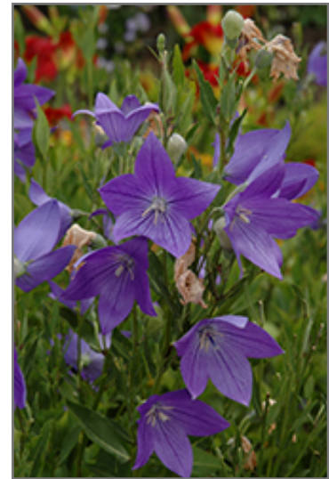
Fuji Blue Balloon Flower flowers