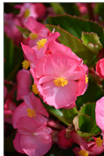
Big Pink Green Leaf Begonia flowers

This is a high maintenance plant that will require regular care and upkeep, and usually looks its best without pruning, although it will tolerate pruning. Deer don't particularly care for this plant and will usually leave it alone in favor of tastier treats. Gardeners should be aware of the following characteristic(s) that may warrant special consideration;