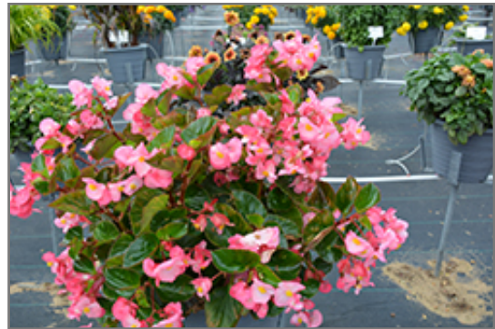
Big Pink Green Leaf Begonia in bloom

Big Pink Green Leaf Begonia is a fine choice for the garden, but it is also a good selection for planting in outdoor containers and hanging baskets. It is often used as a 'filler' in the 'spiller-thriller-filler' container combination, providing a mass of flowers and foliage against which the larger thriller plants stand out. Note that when growing plants in outdoor containers and baskets, they may require more frequent waterings than they would in the yard or garden.