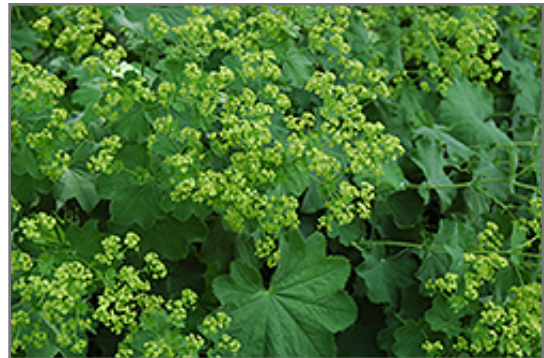
Lady's Mantle flowers

Lady's Mantle is recommended for the following landscape applications;