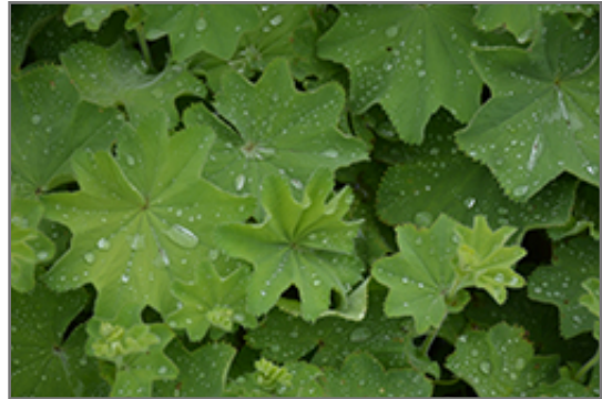
Lady's Mantle foliage

This plant performs well in both full sun and full shade. It is very adaptable to both dry and moist locations, and should do just fine under typical garden conditions. It is not particular as to soil type or pH. It is highly tolerant of urban pollution and will even thrive in inner city environments. This species is not originally from North America. It can be propagated by cuttings.