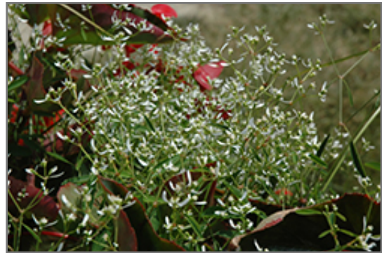
Glitz Euphorbia flowers

Glitz Euphorbia will grow to be about 12 inches tall at maturity, with a spread of 18 inches. When grown in masses or used as a bedding plant, individual plants should be spaced approximately 14 inches apart. Its foliage tends to remain dense right to the ground, not requiring facer plants in front. This fast-growing annual will normally live for one full growing season, needing replacement the following year.