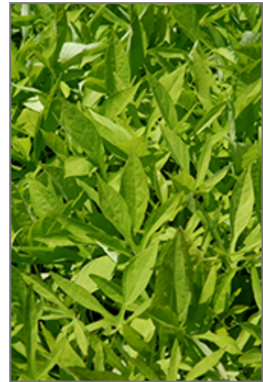
SolarPower Lime Sweet Potato Vine foliage