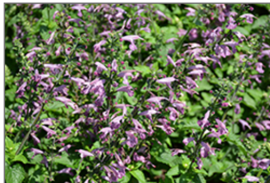
Summer Jewel Lavender Sage flowers

Summer Jewel Lavender Sage is recommended for the following landscape applications;